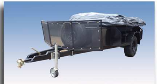
100x50x3.2mm extended heavy duty draw bar