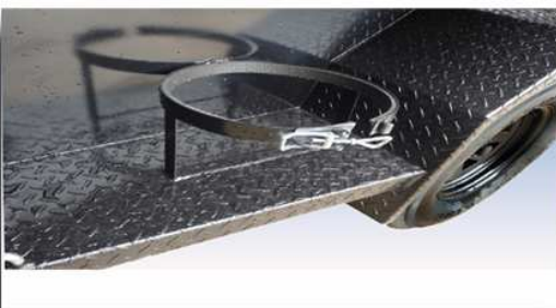
2 gas rings & 2 jerry can holders