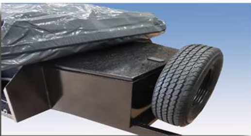
Huge integrated storage box