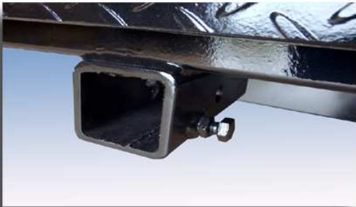
Rear mounted bike sleeve

The Aussie Flinders is an extremely durable off road camper trailer at an affordable price. The Flinders is constructed of zinc anneal like all of our other trailers however comes with extras as standard not found in our Alpine Series.