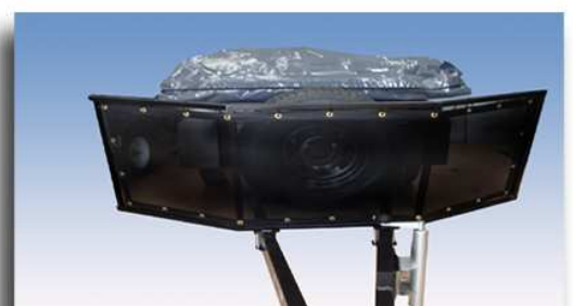
Large Heavy Mesh Stone Guard