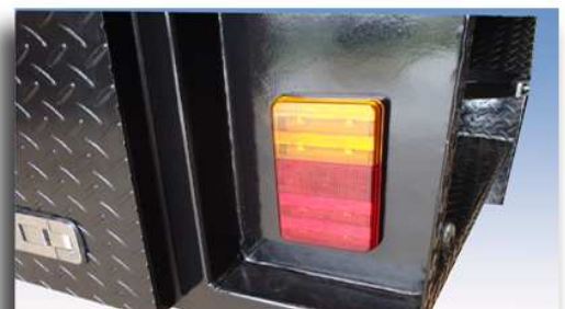
LED lights standard