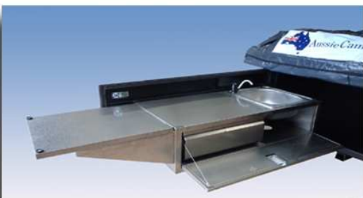
Large stainless steel kitchen