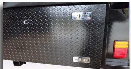
Flush mounted water proof tailgate locks