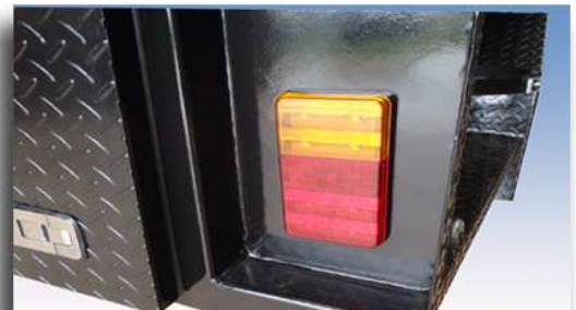
LED lights standard