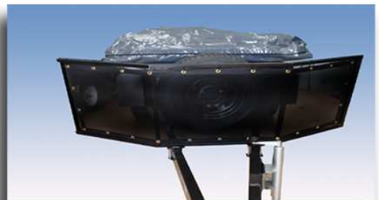
Large heavy mesh stone guard