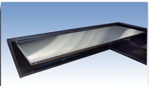
Stainless steel hinged tailgate bench