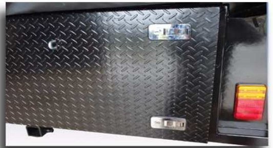
Flush mounted water proof tailgate locks