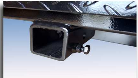
Rear mounted bike sleeve