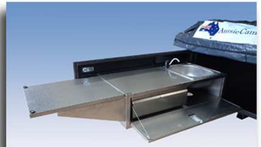
Stainless steel tailgate kitchen - optional