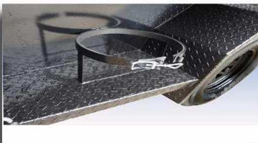
2 gas rings & 2 jerry can holders