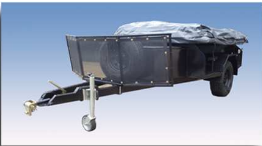
75x50x3.2mm extended heavy duty draw bar

The Aussie Nepean is an extremely durable semi off road camper trailer at an affordable price. The Nepean is constructed of zinc anneal like all of our other trailers however comes with extras as standard not found in our Alpine Series.